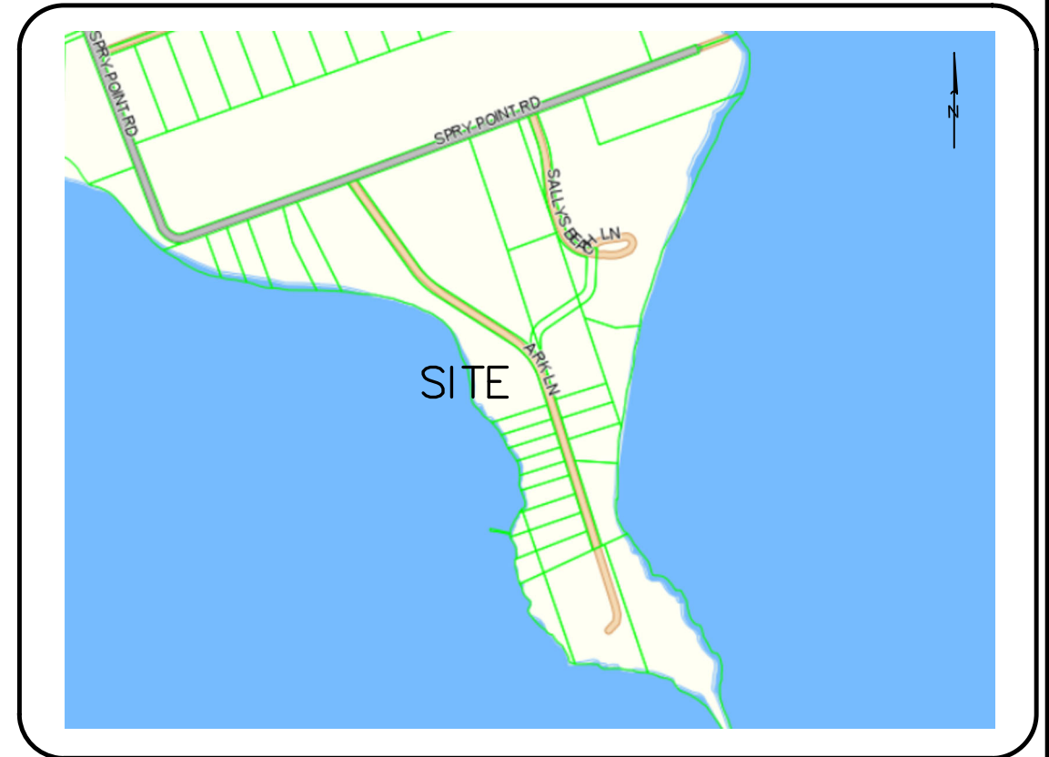
KEY PLAN N.T.S.